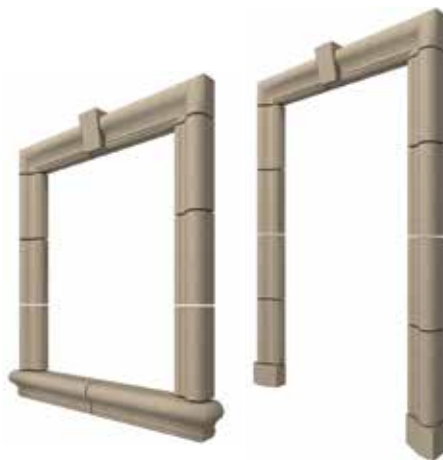
DOOR AND WINDOW TRIM KITS